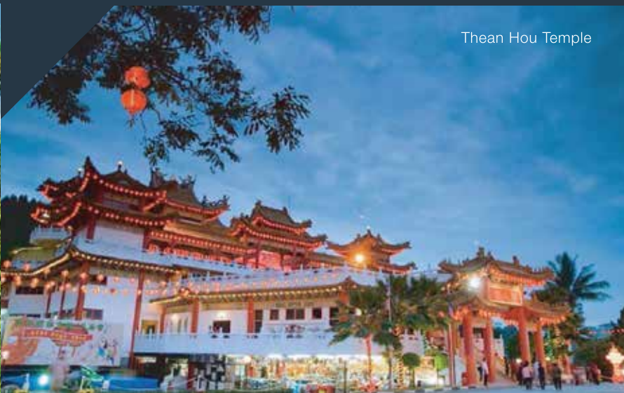
Thean Hou Temple

Borneo is an island of mystery, legend and folklore that was once home to fierce warriors and headhunters. While heads are no longer prized, the traditions live on with many tribal communities respected for their hunting prowess. Explore a typical village, admire the colourful dresses, ornate tattoos, extended ear-lobes of older women and participate in the native dancing and singing. Learn how to use a blowpipe, enjoy traditional food sourced from the jungle and drink the local 'jungle juice' called tuak.