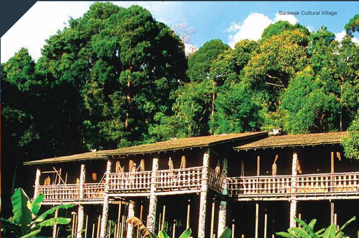
Sarawak Cultural Village

Borneo is an island of mystery, legend and folklore that was once home to fierce warriors and headhunters. While heads are no longer prized, the traditions live on with many tribal communities respected for their hunting prowess. Explore a typical village, admire the colourful dresses, ornate tattoos, extended ear-lobes of older women and participate in the native dancing and singing. Learn how to use a blowpipe, enjoy traditional food sourced from the jungle and drink the local 'jungle juice' called tuak.