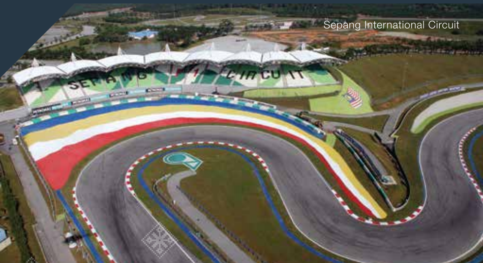
Sepang International Circuit