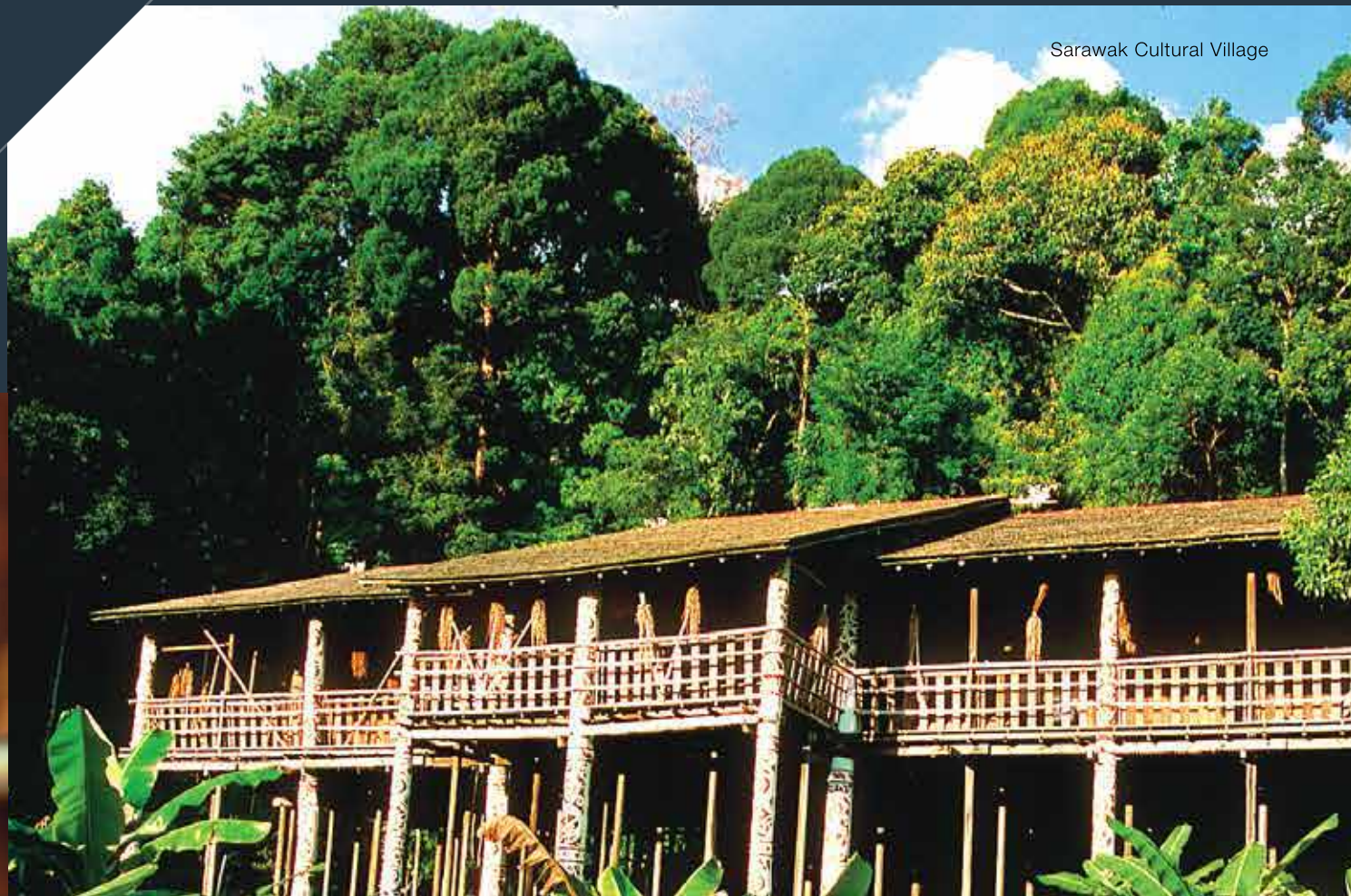
Sarawak Cultural Village

Borneo is an island of mystery, legend and folklore that was once home to fierce warriors and headhunters. While heads are no longer prized, the traditions live on with many tribal communities respected for their hunting prowess. Explore a typical village, admire the colourful dresses, ornate tattoos, extended ear-lobes of older women and participate in the native dancing and singing. Learn how to use a blowpipe, enjoy traditional food sourced from the jungle and drink the local 'jungle juice' called tuak.