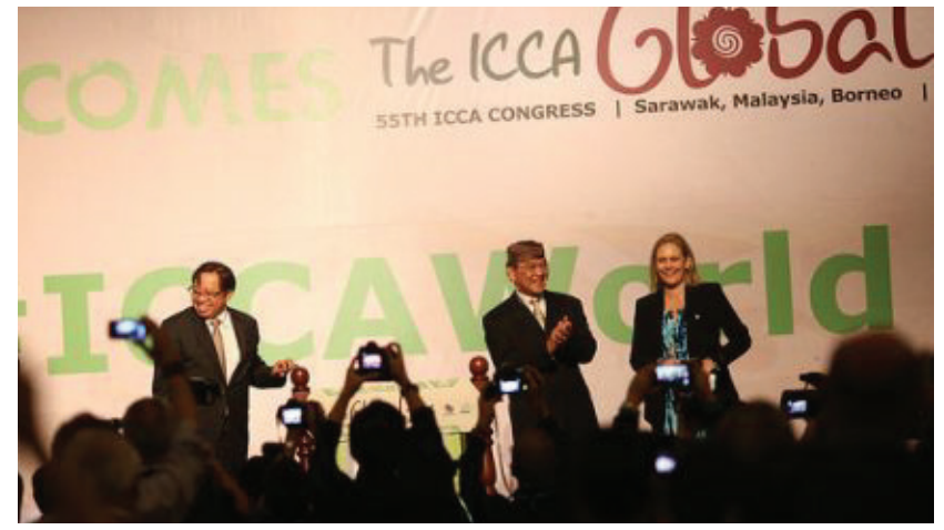
The 55th International Congress and Convention Association (ICCA) Congress 2016 kicks off

THE SUSTAINABILITY OF THE BUSINESS EVENTS INDUSTRY IN MALAYSIA LEVERAGING INTER-ORGANISATIONAL COLLABORATION FOR THE 55TH ICCA CONGRESS